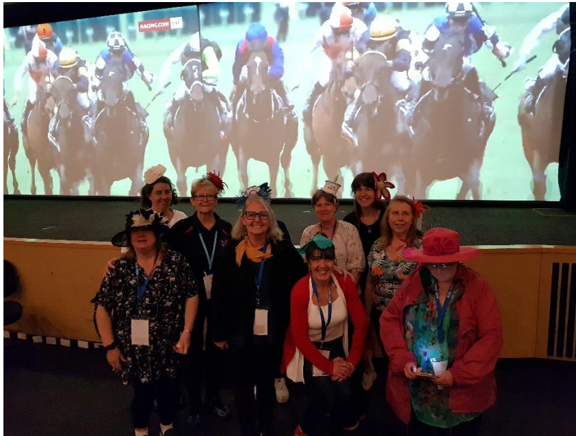
It's glammed up time during Melbourne Cup Day